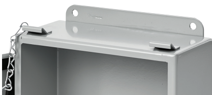
Welded, full-width wall-mounting brackets provide a solid, integrated installation means