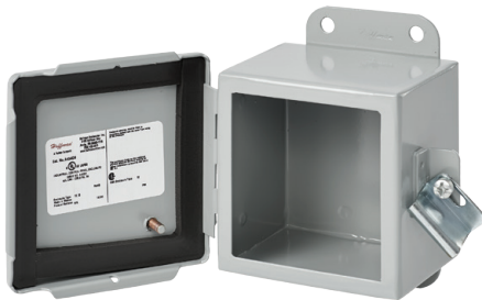
Continuous Hinge with Clamps, Type 12

Get nVent HOFFMAN's premium protection junction boxes, designed to protect electrical connections in numerous environments, without having to spend the time and money doing a modification. Twenty-six new standard sizes across various junction box families offer a wider selection of size options. Look to HOFFMAN for the broadest mild steel junction box offering.