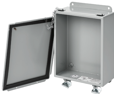
Lift-Off Cover, Type 12