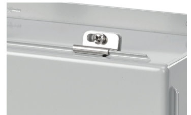
Clamp and screw latching options provide protection and security