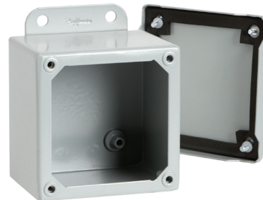
Screw Cover, Type 12