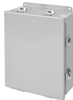
Continuous Hinge with Clamps, Type 4