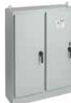
Free-Stand Disconnect with Quick-Release Hinge, Type 4 Bulletin A4L3D